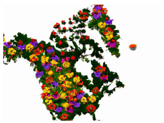
Fragrance Creators makes progress on key State legislative issues

Weighing in on fragrance-related legislation, Fragrance Creators has made advancements in the states.